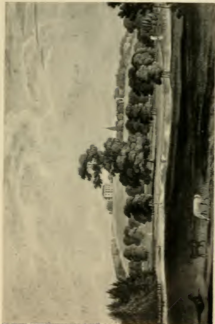
ETCOVILL IN 1773